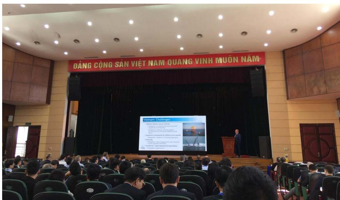
Hình 2: Phiên toàn thể.

Figure 1: Representatives of sponsors, AVSE Global, NUCE, invited and keynote speakers and VSOE2018 Organising Committee.