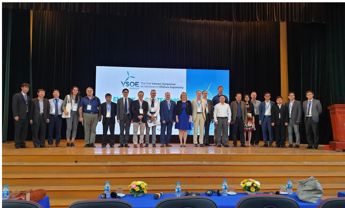
Hình 1: Đại diện các nhà tài trợ, AVSE, ĐHXD, các diễn giả mời, và Ban tổ chức Hội thảo.

Figure 1: Representatives of sponsors, AVSE Global, NUCE, invited and keynote speakers and VSOE2018 Organising Committee.