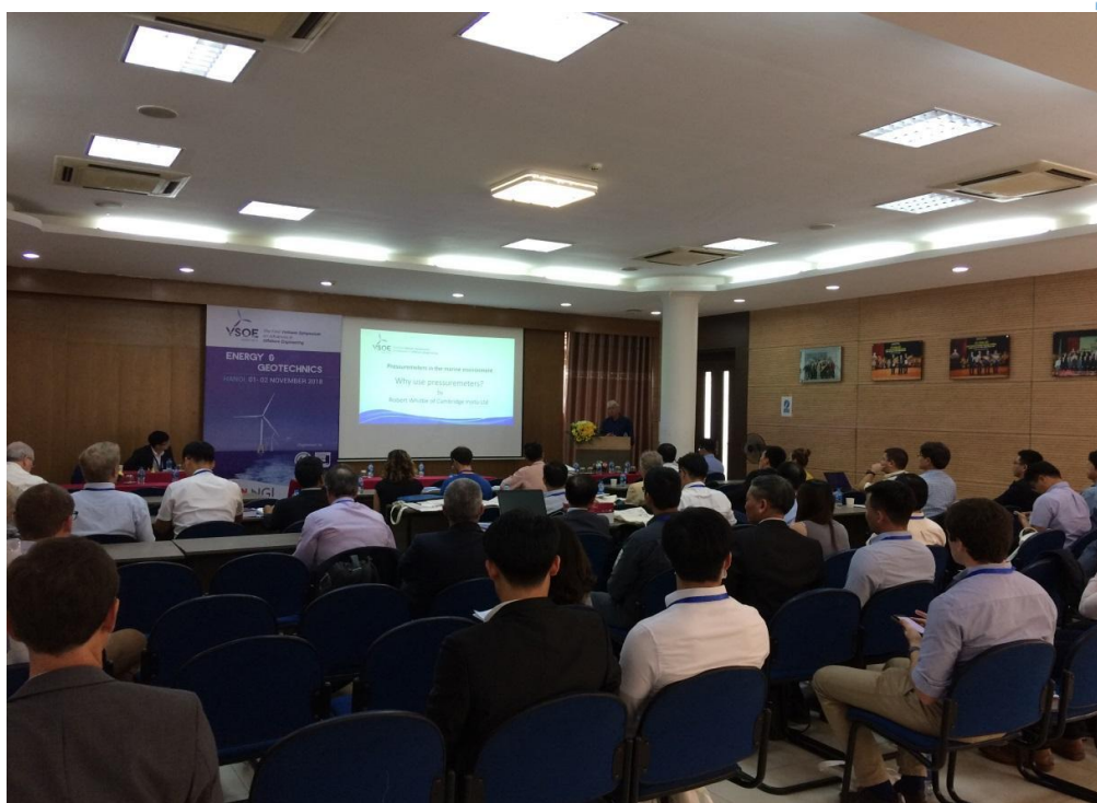
Hình 3: Phiên song hành 1.