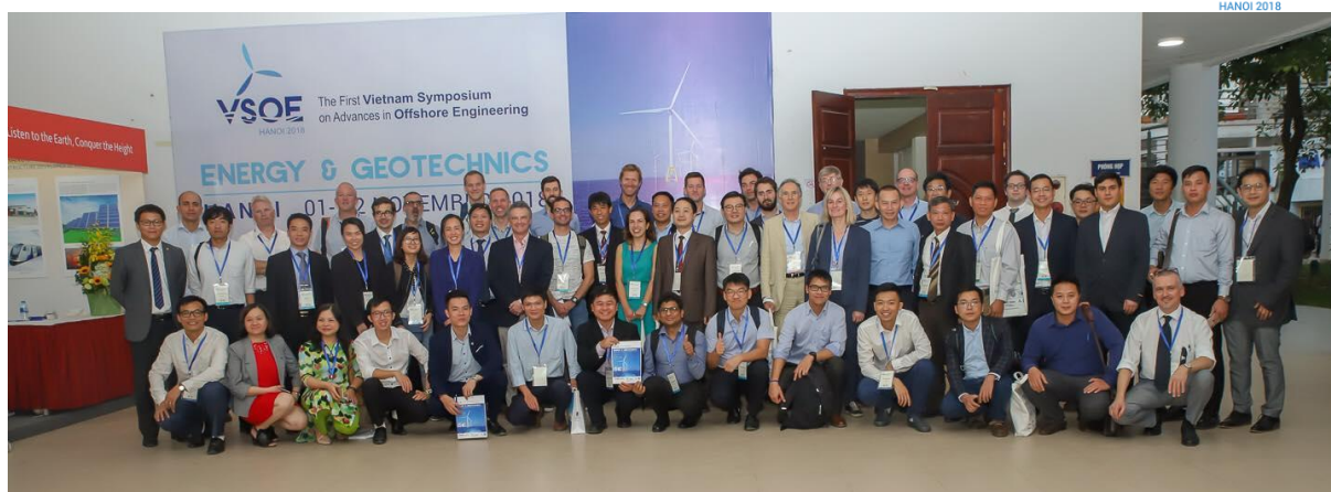
Hình 5: Một số người tham dự ở phiên cuối cùng của Hội thảo.

Figure 5: A group of participants after the closing ceremony.