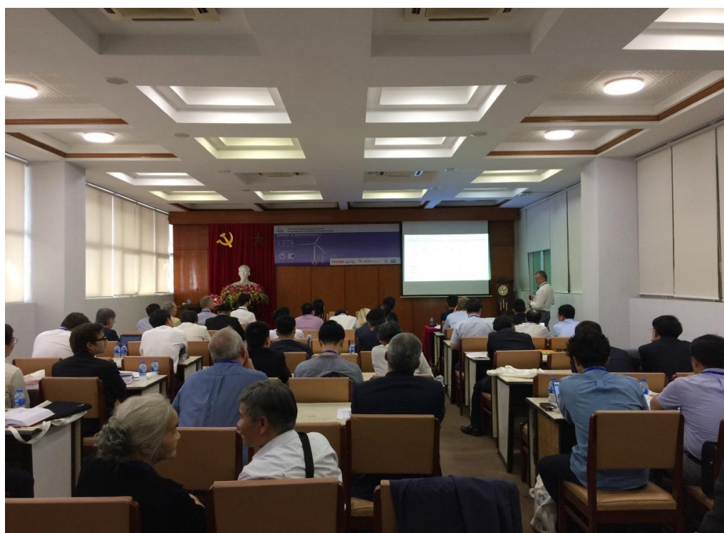
Hình 4: Phiên song hành 2.